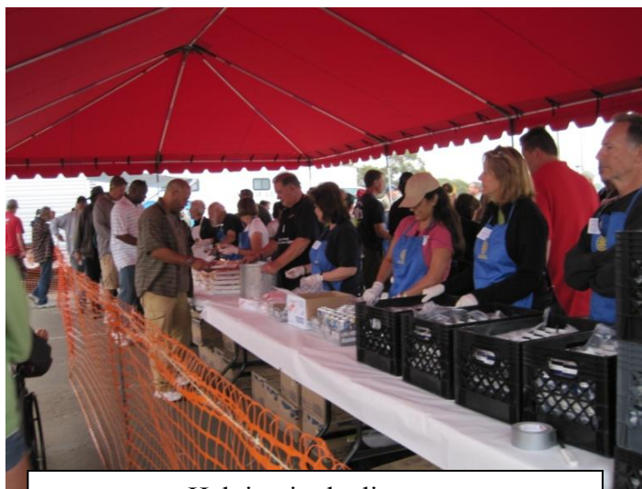
Helping in the line....