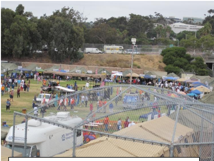
Overview of the field at San Diego High